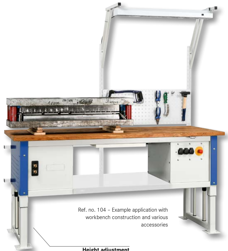
Ref. no. 104 – Example application with workbench construction and various accessories

Height adjustment at the touch of a button via 4 electric motors